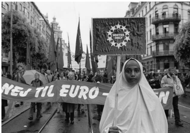
Ill. 9.2 Europeans demonstrate against the European Union at the 2001 EU Summit in Gothenburg. In front of the demonstration is a woman of colour with her own demonstration against the exclusion of minorities in Europe.