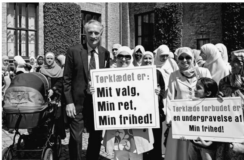
Ill. 9.1 Danish Muslim women demonstrate for the right to veil. The sign says, 'The headscarf is my choice, my right, my freedom'. The man in the picture is the liberal Bertel Haarder, who was Minister of Integration at the time.

The right thing is therefore to ban the veil and live accordingly to our customs here in Denmark. 15